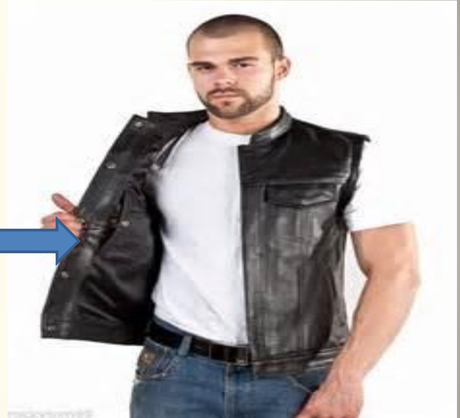
Concealed pockets inside the vest