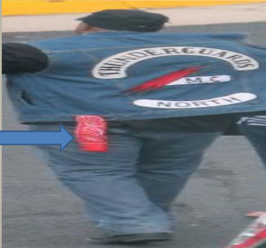
Bandannas hanging out of the rear pockets, will usually have a pad lock tied to the other end.